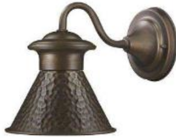
Hampton Bay Essen Antique Copper Outdoor Wall Lantern