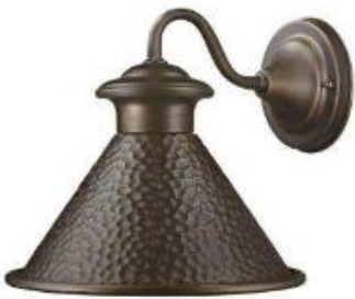
Hampton Bay Essen Antique Copper Outdoor Wall Lantern