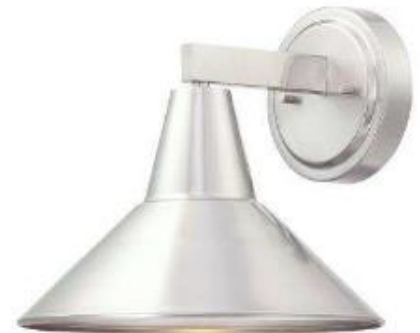
the great outdoors by Minka Lavery Bay Crest 1-Light Brushed Aluminum Outdoor Wall Mount