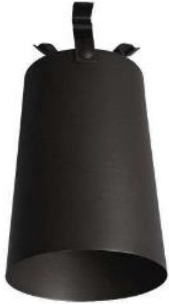
Progress Lighting Nightsaver Dark-Sky Black Exterior Accessory