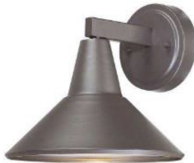
the great outdoors by Minka Lavery Bay Crest 1-Light Dorian Bronze Outdoor Wall Mount