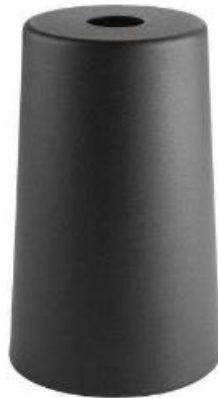
Progress Lighting Large Dark Sky Night Saver Black Accessory Shield