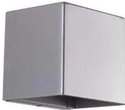
Progress Lighting Cornice Collection 1-Light Metallic Gray Outdoor Wall Sconce