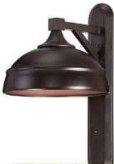
Cole 1-Light English Bronze Outdoor Mount Lantern