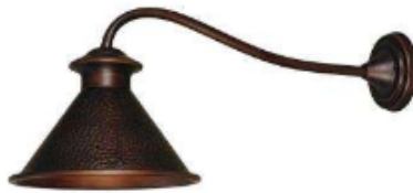
World Imports Dark Sky Essen 1-Light Outdoor Antique Copper Long Arm Wall Lamp