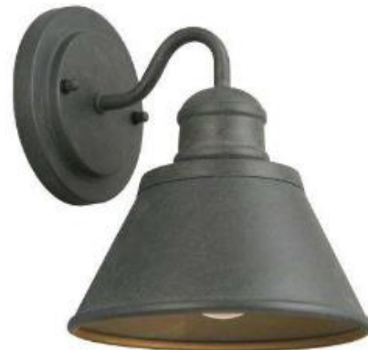
Design House Mason RLM Oil-Rubbed Bronze Outdoor Wall-Mount Dark-Sky Downlight