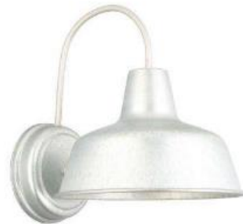
Design House Mason RLM Galvanized Outdoor Wall-Mount Dark-Sky Downlight