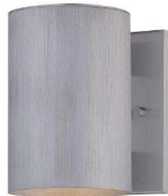
the great outdoors by Minka Lavery Skyline 1-Light Brushed Aluminum Outdoor Wall Mount Lantern