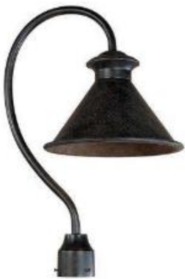
World Imports Dark Sky Essen 1-Light Outdoor Bronze Post Lamp