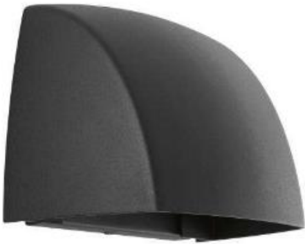
Progress Lighting Cornice Collection 1-Light Black Wall Sconce