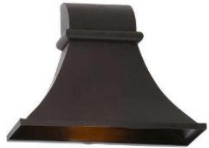
World Imports Dark Sky Revere Collection 10 in. 1-Light Flemish Outdoor Wall Lantern