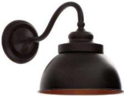
World Imports Dark Sky Magazine Street Outdoor 1-Light Wall